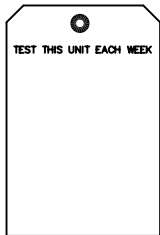
SP170 TEST TAG