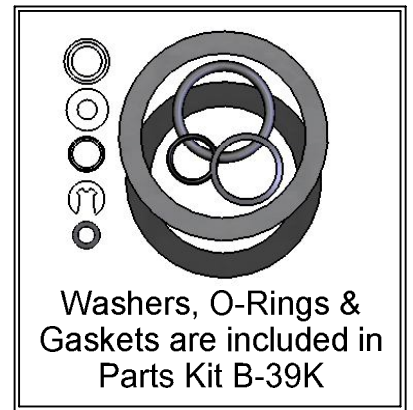
Washers, O-Rings & Gaskets are included in Parts Kit B-39K

Also Furnished w/ Sealing Cap When Overflow Tube Coupling Nut is Not Used. PN# 012640-45