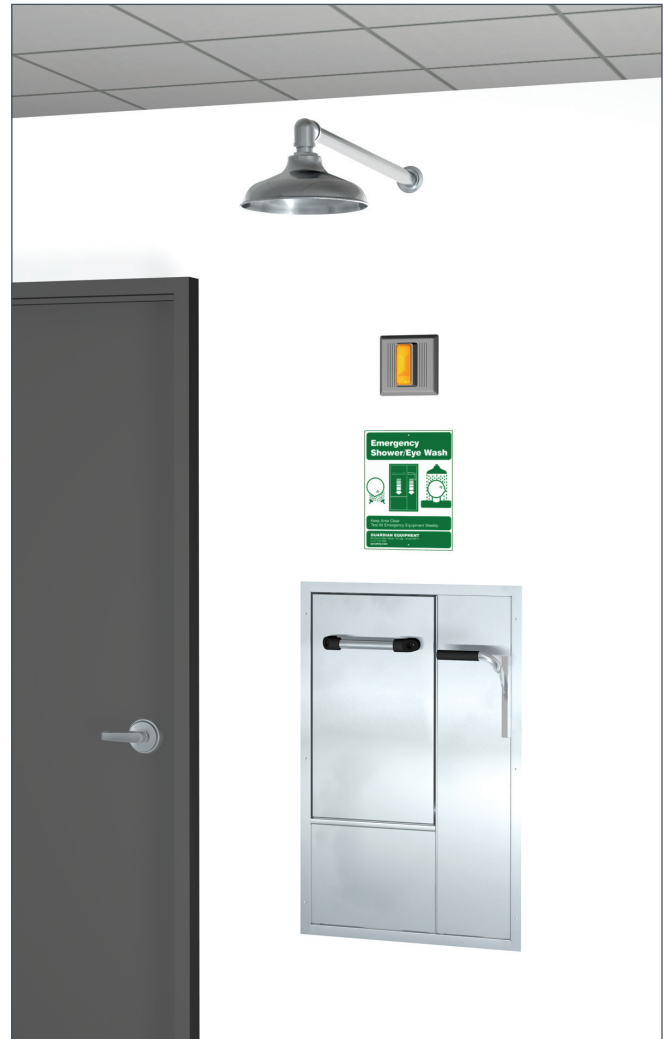
Note: Shown with optional AP280-230 electric light and alarm horn unit (sold separately).