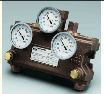
SE-350 1-3 Drench Shower Units 3 - 60 gpm

The SE 350 controllers will maintain outlet temperature to within 5°F.