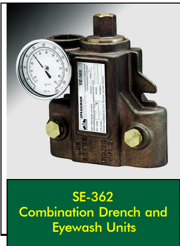
SE-362 Combination Drench and Eyewash Units