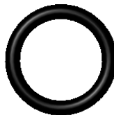
Back-up (2) Washer