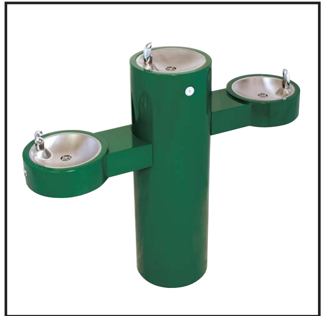
□ Standard Model: GRQ45

Model GRQ45 is a barrier free pedestal mounted, vandal resistant, tri-level round drinking fountain made from 18 gage, 304 stainless steel bowls mounted into a green powder coated 11 gage, heavy duty galvanized welded steel pedestal. Unit shall be activated by front mounted self-closing buttons, by using less than 5 pounds of force, which activates internally mounted valves with adjustable stream regulators controlling the water flow. Bubblers shall be polished chrome plated brass with non-squirt features and operate on water pressure range of 20-105 psig. Unit shall adhere to ANSI A117.1 and Americans with Disabilities Act of 1990 frontal approach and protruding objects requirements, Child ADA parallel and frontal approach and ANSI/NSF 61, Section 9.